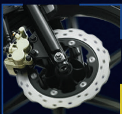
ROTOPETAL DISC BRAKE