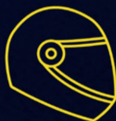
HELMET ATTENTION INDICATION